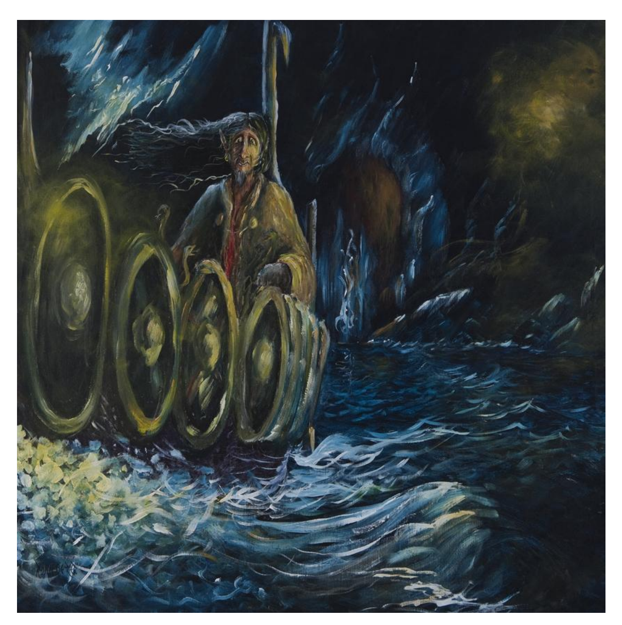
Loki and Ragnarok

In the decisive battle of Ragnarok at the battlefield Vigrid approached departed Loki from the underworld on the ship Naglfar. The ship was made of dead men's nails, and at the helm was Loki.