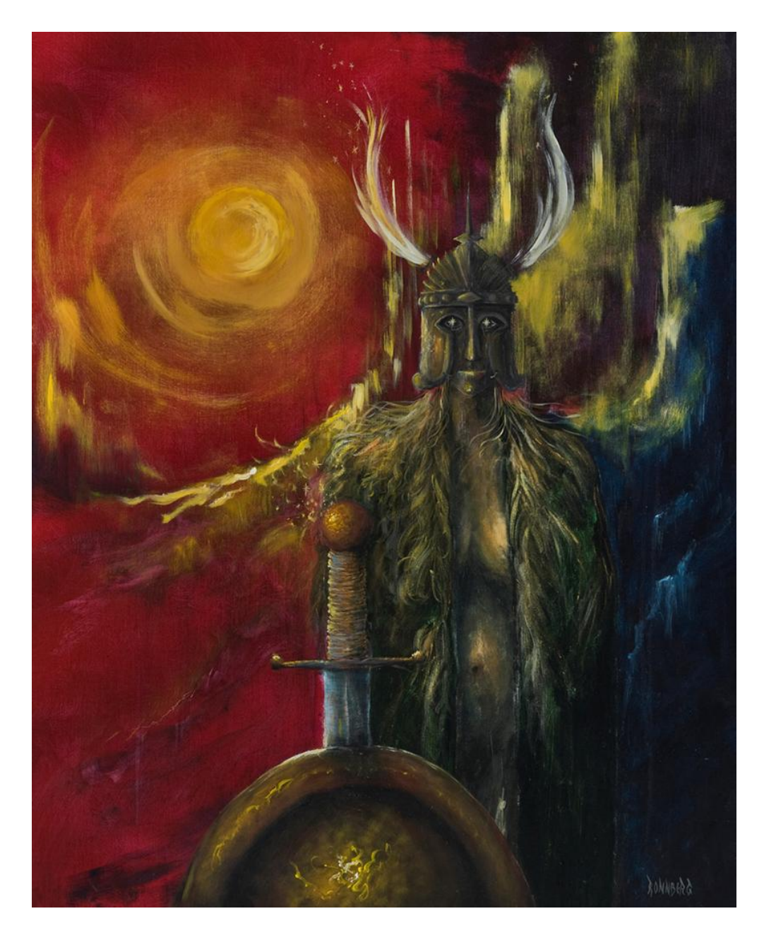
The valkyrians eye

It is said in myths to a Valkyrias gaze can kill. In mythology, they appear as lovely as sometimes death goddesses. On the battlefield they choose and Odin out of the mighty men who died. Along with the Valkyries, the ride up the rainbow to a waiting and carefree life in Valhalla. The beautiful Valkyries pleases warriors every day until the final battle on Vigrid at Ragnarok. Hild, Skuld and Hlin are some of the many Valkyries.